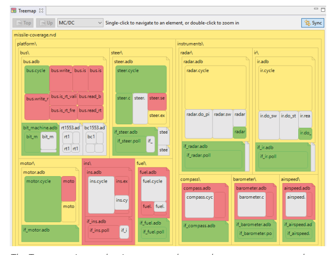
The Treemap view makes it easy to understand your coverage at a glance

Rapi Cover 's instrumentation process can be customized to suit your coverage analysis needs. Whether you need to perform incremental coverage, instrument "literal" or "traditional" MC/DC decisions or analyze coverage on multi-core architectures, Rapi Cover has everything you need.